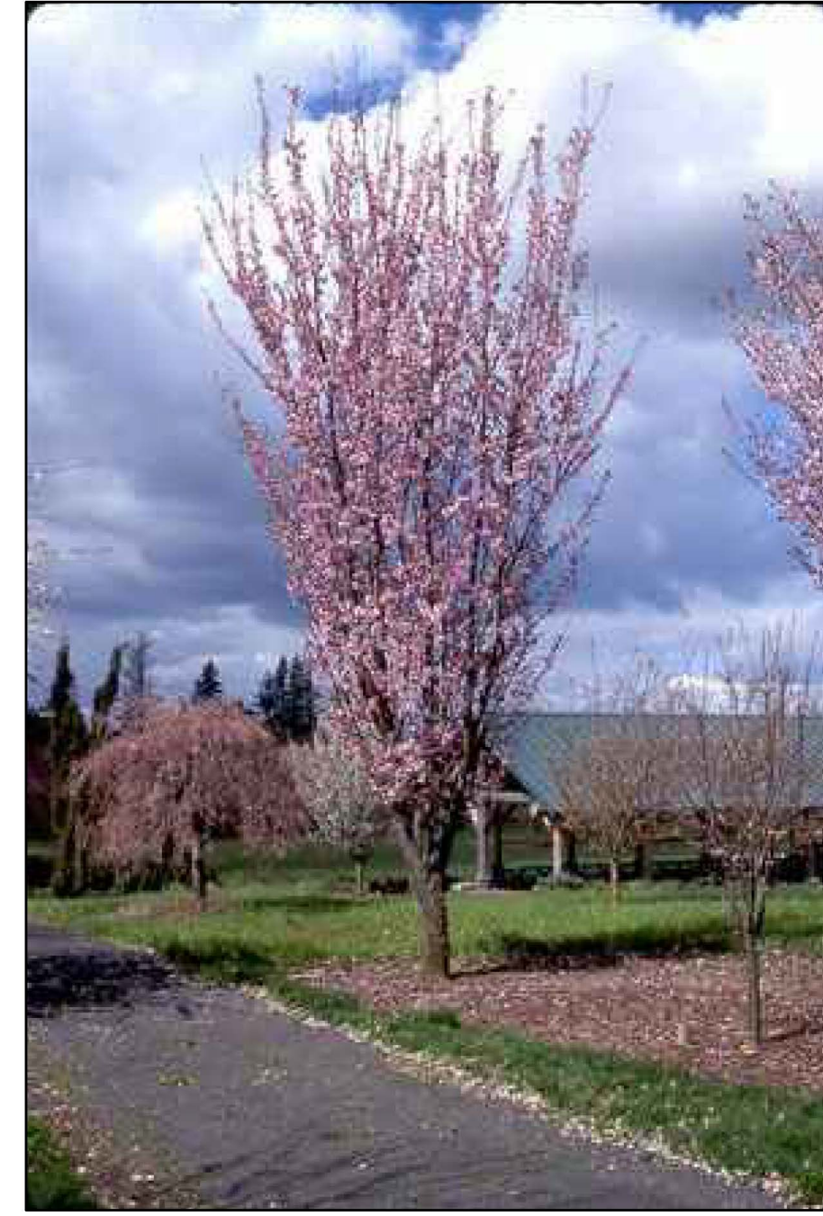
COLUMNAR SARGENT CHERRY