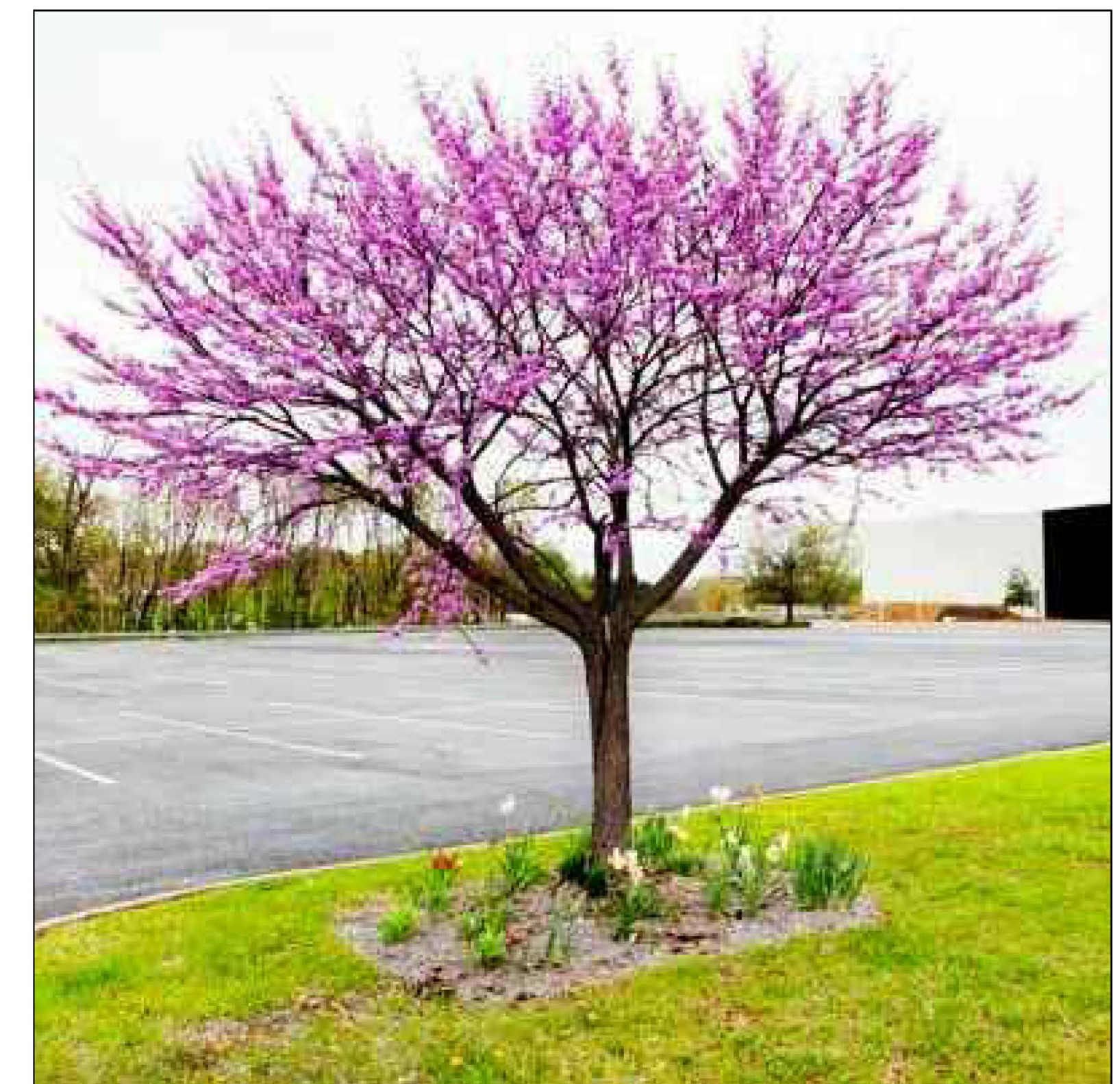
EASTERN RED BUD