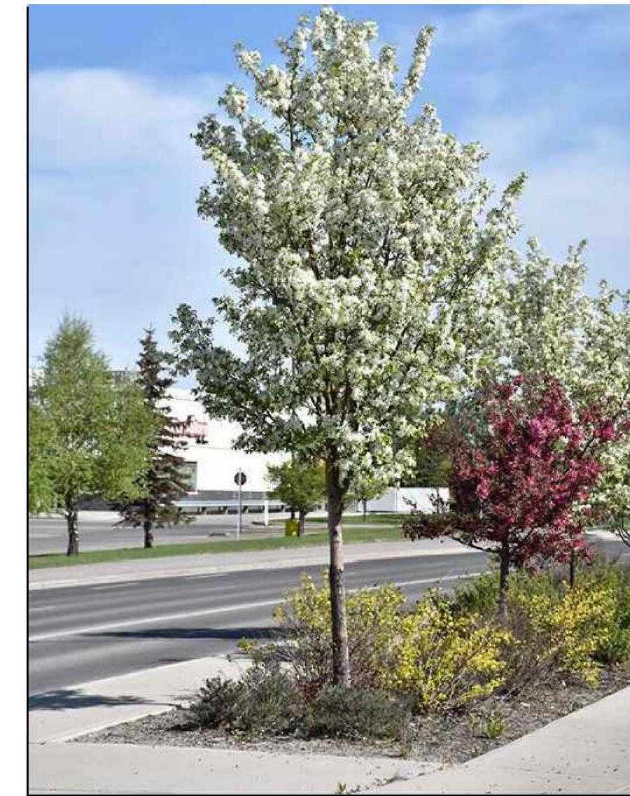
COLUMNAR SIBERIAN CRABAPPLE