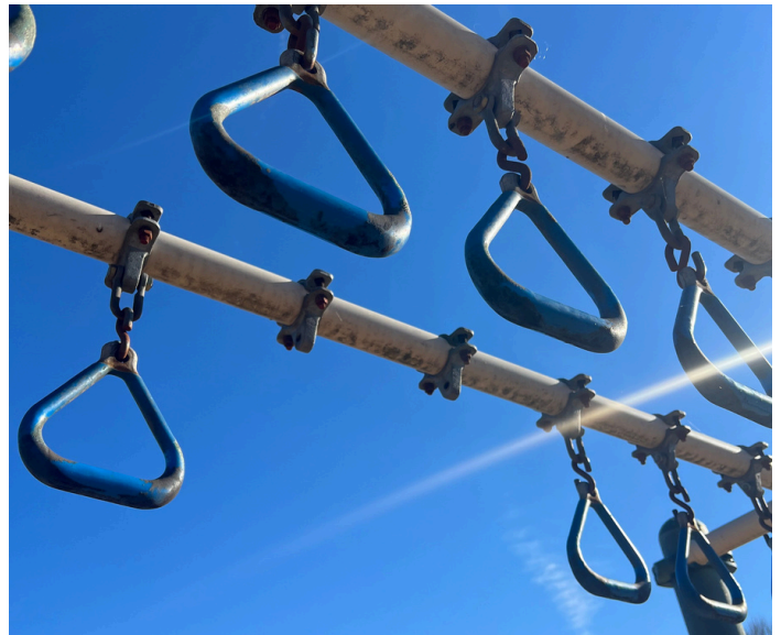
Above: missing rungs in monkey bars and rusting. Left: One of countless examples of missing, cracked, and/or rusted bolts.