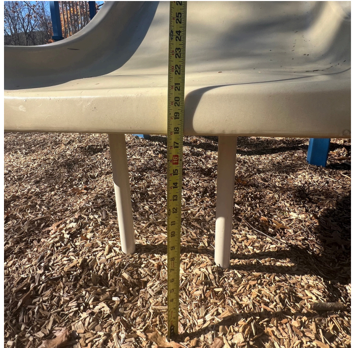
Above: non-compliant structures: playground safety codes from Consumer Product Safety Commission (CPSC) and American Society for Testing and Materials (ASTM) require the height of the slide exit region should be no more than 7" for preschoolers and no more than 11" for kids aged 5-12 to ensure safe transitions from the slide to the ground.