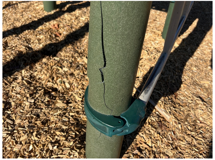
Above: Significant structural deterioration is evident across structures posing ongoing risk.